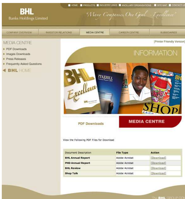
PIX CAPTION: Visitors to the website can download PDF versions of BHL's publications ranging from the Annual Report to the BHL Review and Shop Talk.